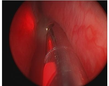
Laser fiber ready to start vaporization