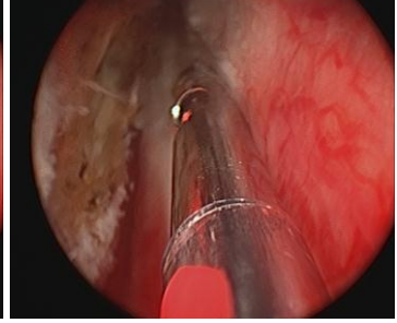
Part of obstructing prostate removed by vaporization

With vaporization, the obstructing parts are removed (like TURP) which distinguishes it from the other procedures that coagulate the prostate. With vaporization (removal), the urinary channel is opened up which leads to more immediate improvement in urinary flow. Compared to TURP, PVP has the following advantages: Outpatient or overnight procedure, less chance of bleeding, faster return to activities and reduced time period of catheterization.