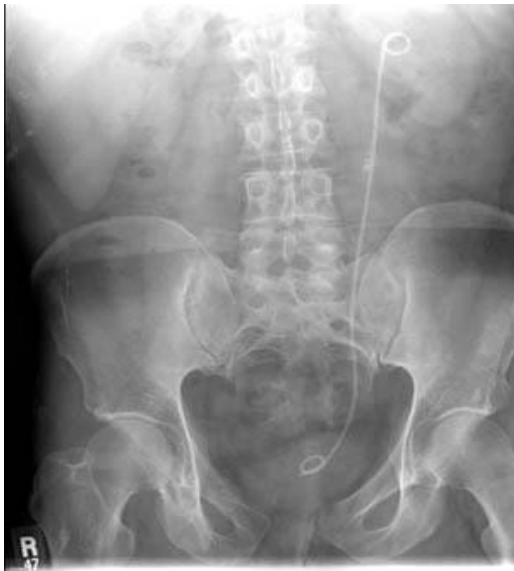
KUB (plain abdominal x-ray) that shows stent in position to bypass stone allowing kidney to drain. (The stent is the long white tube with curls at each end)

Patients are usually discharged several hours after the procedure. In some cases, as part of the ESWL procedure, a stent may be placed to promote passage of stone pieces or to prevent the kidney from becoming blocked. (See more details in Kidney Stone newsletter)