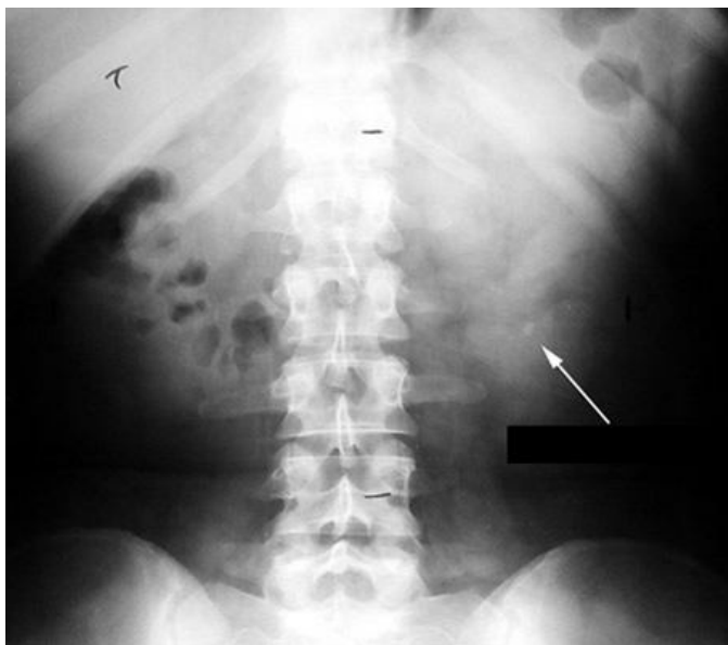
X-ray showing stone in kidney marked by the arrow.

Extracorporeal Shock Wave Lithotripsy (ESWL) is a valuable technique available to help manage kidney stones. ESWL is a technique that uses shockwave energy to fragment a stone into smaller pieces so that these smaller pieces can be passed more easily.